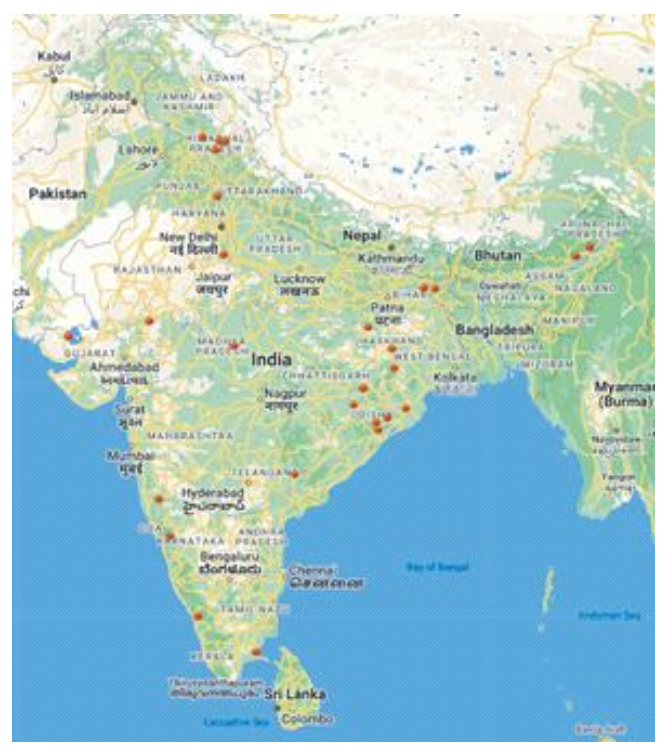
Fig. 3 : Plant genetic resource map of Oryza sp. in India.

subpopulations has become increasingly refined. These studies underline the complexity of rice genetics and the influence of domestication, artificial selection, and natural distribution on the phylogeny of rice.